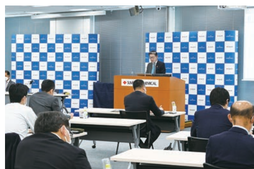
IR Day Spring (June 2022)